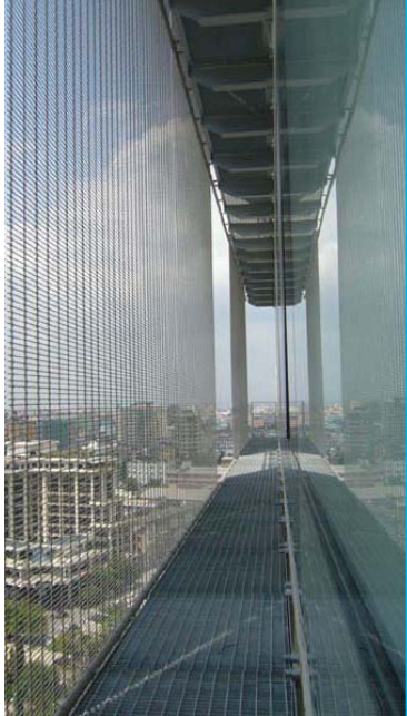
Mesh facade screen / gangway