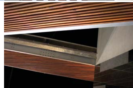
Entry canopy detail