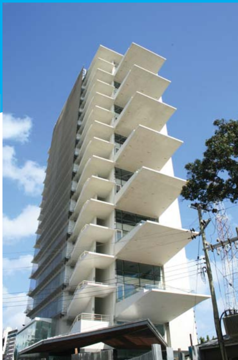
Front facade / end terrace view