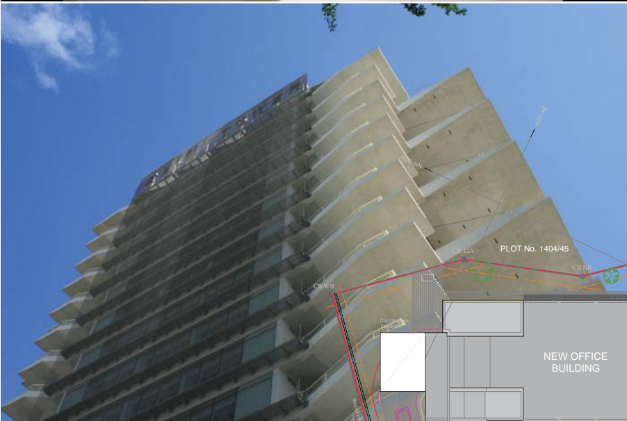
Front facade / mesh screen

This project was initiated, with the concept design performed, by SPASM Design Architects in Mumbai, India. IPA Architects, Dar es Salaam, Tanzania, performed design development & documentation and construction supervision services as local co-architects.